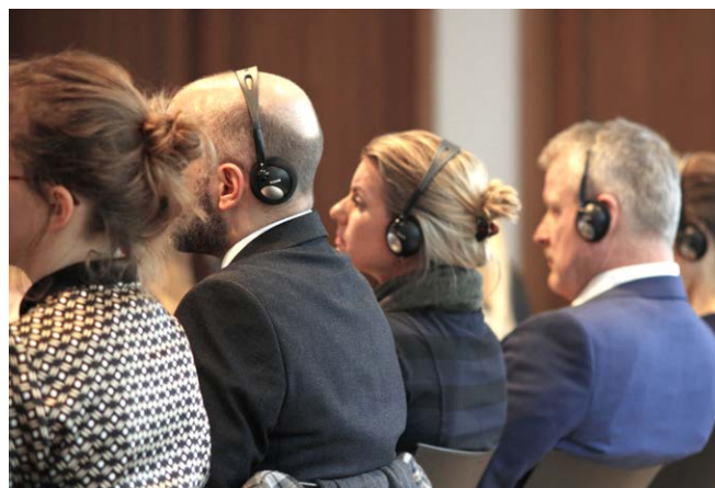
Participants of the conference. Interpretation was provided both for English and German.

tribution of responsibilities covers the Federation, the Länder, local authorities and large numbers of non-governmental organisations (NGOs).” A number of laws intended to make return easier have already been passed in Germany. The Act Improving the Enforcement of the Obligation to Leave the Country (Gesetz zur besseren Durchsetzung der Ausreisepflicht) for instance aims above all to return persons who place the security of the country at risk. A centre has been established in Berlin to support returns (ZUR) in order to improve coordination between the Federation and the Länder, with the Federal Office for Migration and Refugees and the Federal Police also represented. The funding has however also been increased: the Federal Ministry of the Interior has 40 million euro at hand for special programmes targeting returnees. The Federal Ministry for Economic Cooperation and Development is also spending another 50 million euro on reintegration programmes. The focus here is on establishing migration centres which will be run by the GIZ (Gesellschaft für internationale Zusammenarbeit).